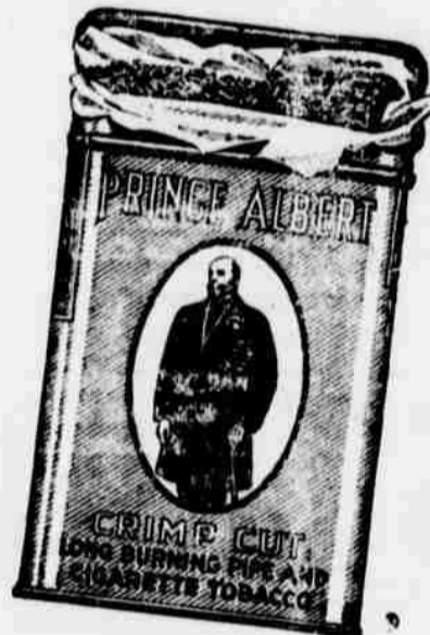
The tidy red tin, 10c

You get acquainted with Prince Albert in the toppy red bag, 5c; or tidy red tin, 10c, but for the double-back-action-joy, you buy a crystal-glass pound humidor. And then you're set! You see, it has the sponge-moistener top and keeps P. A. at the highest top-notch point of perfection. Prince Albert is also sold in pound and half-pound tin humidors.