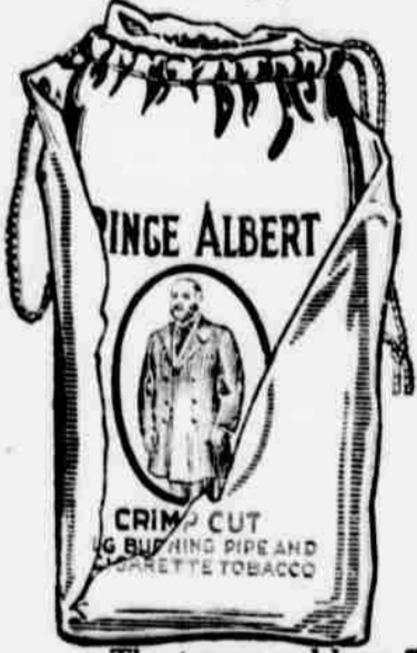
The toppy red bag, 5c

Yes, sir. P. A. puts a razor edge on your smoke-appetite-division that's nobby enough to be photographed! No other pipe and cigarette tobacco can be like Prince Albert, because no other tobacco can be made like Prince Albert. The patented process fixes that—and removes the tongue-bite and throat parch! Let that digest!