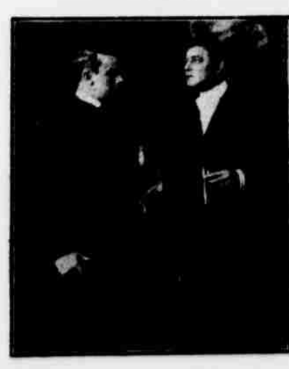
Scene from coming attraction at the Photoplay Airdome