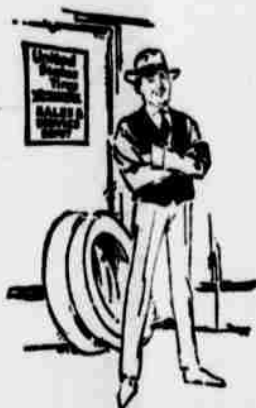
"The most essential man for you to know today in the tire business is your local U. S. Tire Dealer."

Its very simplicity — two diagonal rows of oblong studs, interlocking in their grip on the road — is the result of all the years of U. S. Rubber experience with every type of road the world over.