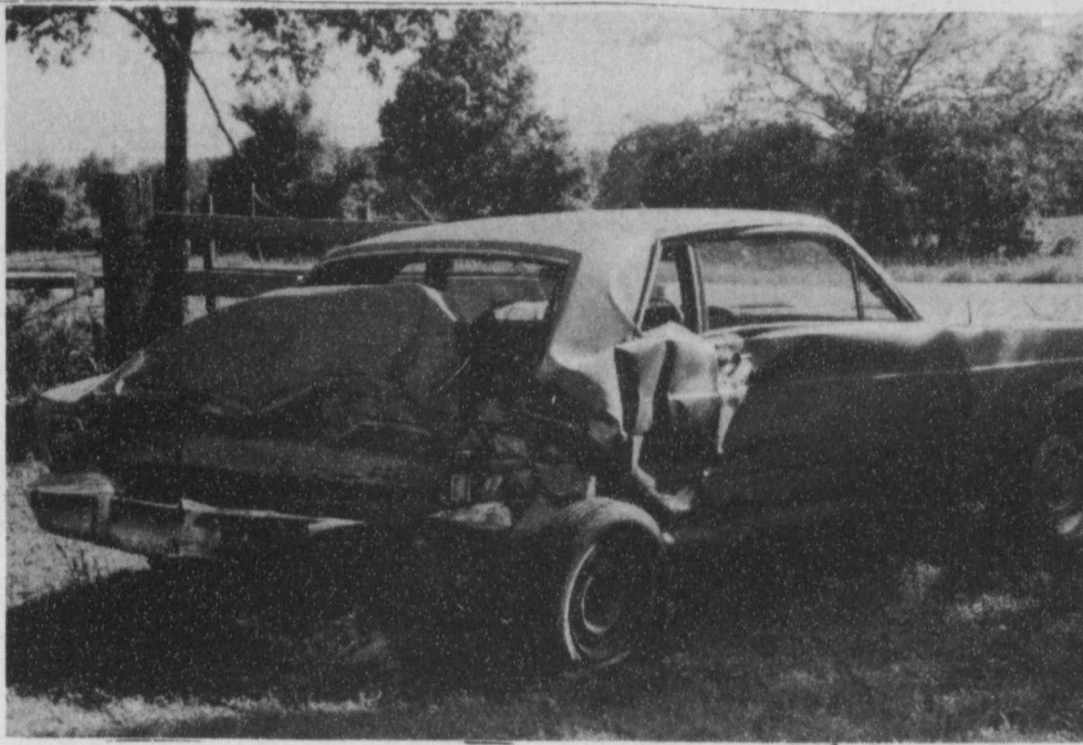
HIGHWAY patrol officers investigated a major auto accident approximately two miles south of Talco on U.S. Highway 271 Tuesday evening. According to officers in-