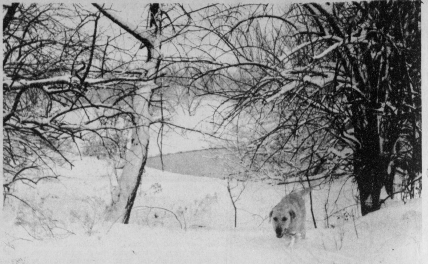
SNOWY FUN for dogs, kids and the young at heart was provided by last week's snowfall which seems to have put everyone in the Christmas spirit.