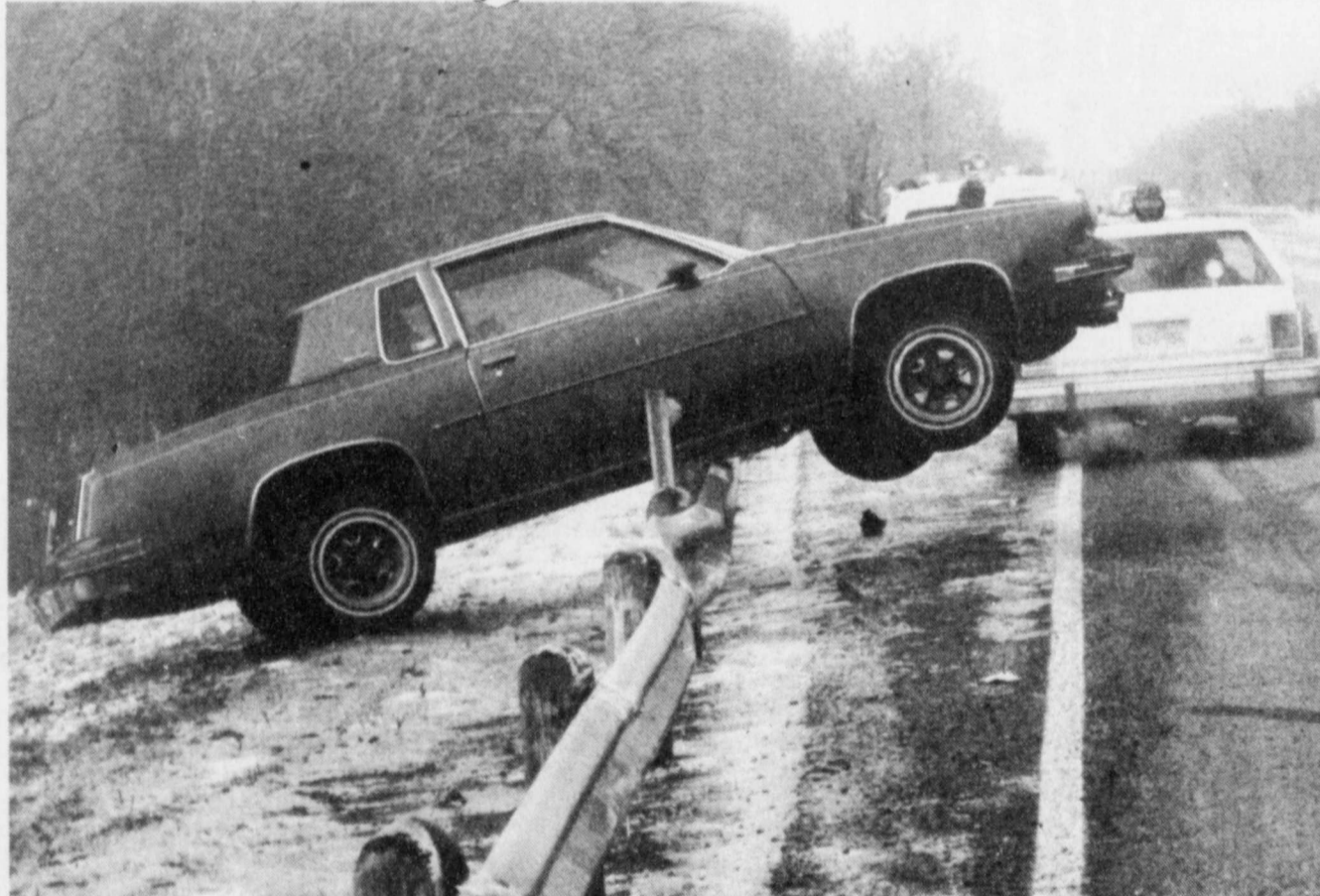
UP IN THE AIR over ice seemed to be the situation as their 1983

Don't delay, take advantage of this extended sale if you haven't already!