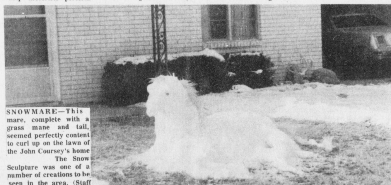
SNOWMARE —This mare, complete with a grass mane and tail, seemed perfectly content to curl up on the lawn of the John Coursey's home

and frustrating this past week. (Staff Photo)