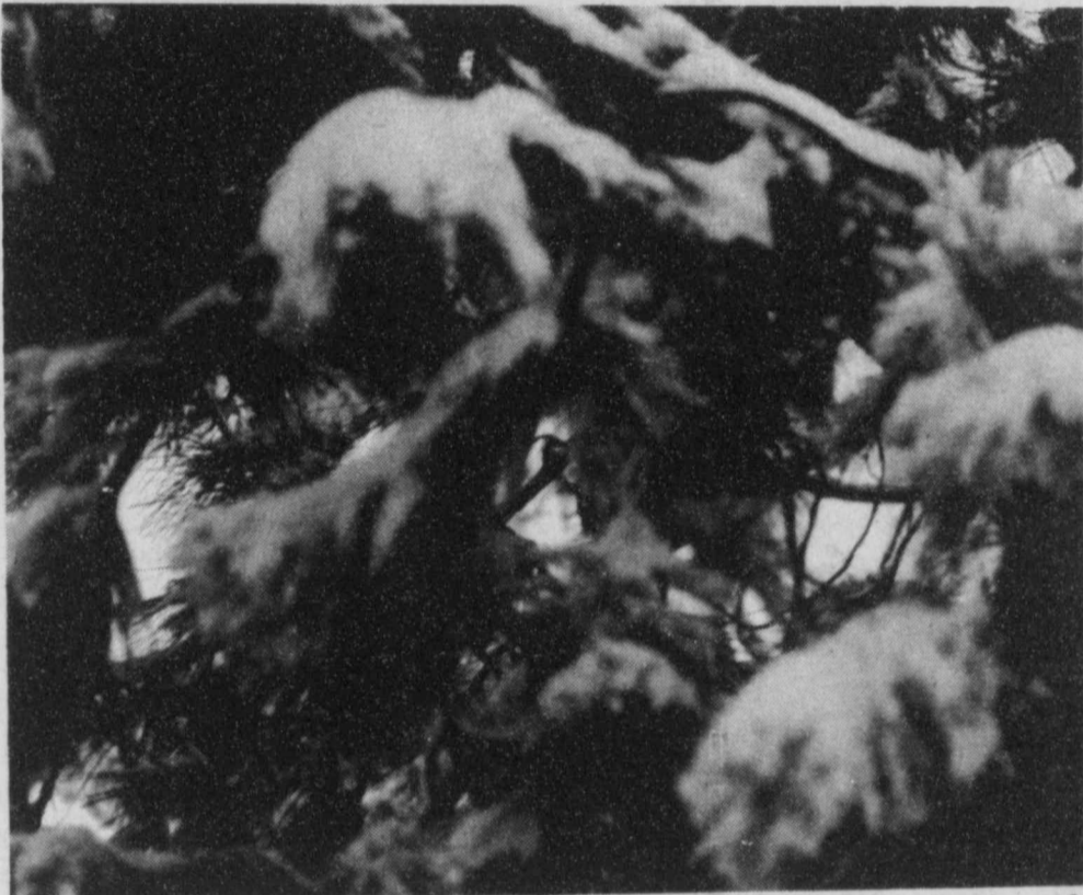
SNOWY BRANCHES —up to eight inches of snow fell last Friday leaving trees covered with pic-

This Salute Sponsored By BOGATA FUNERAL HOME