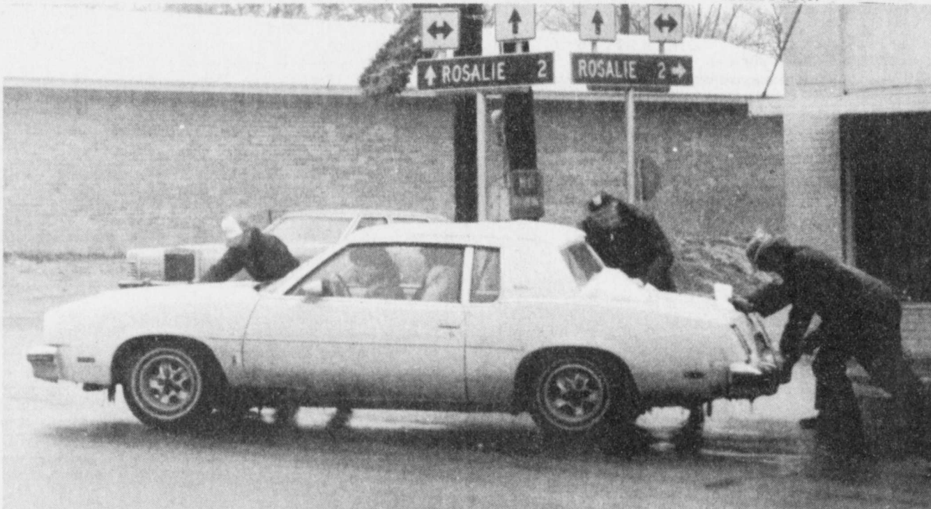
GETAWAY —Extra hands worked hard to help motorists perform

a spin, and the semi hit the rear end of it while trying to avoid the vehicle. One girl was injured in the accident.