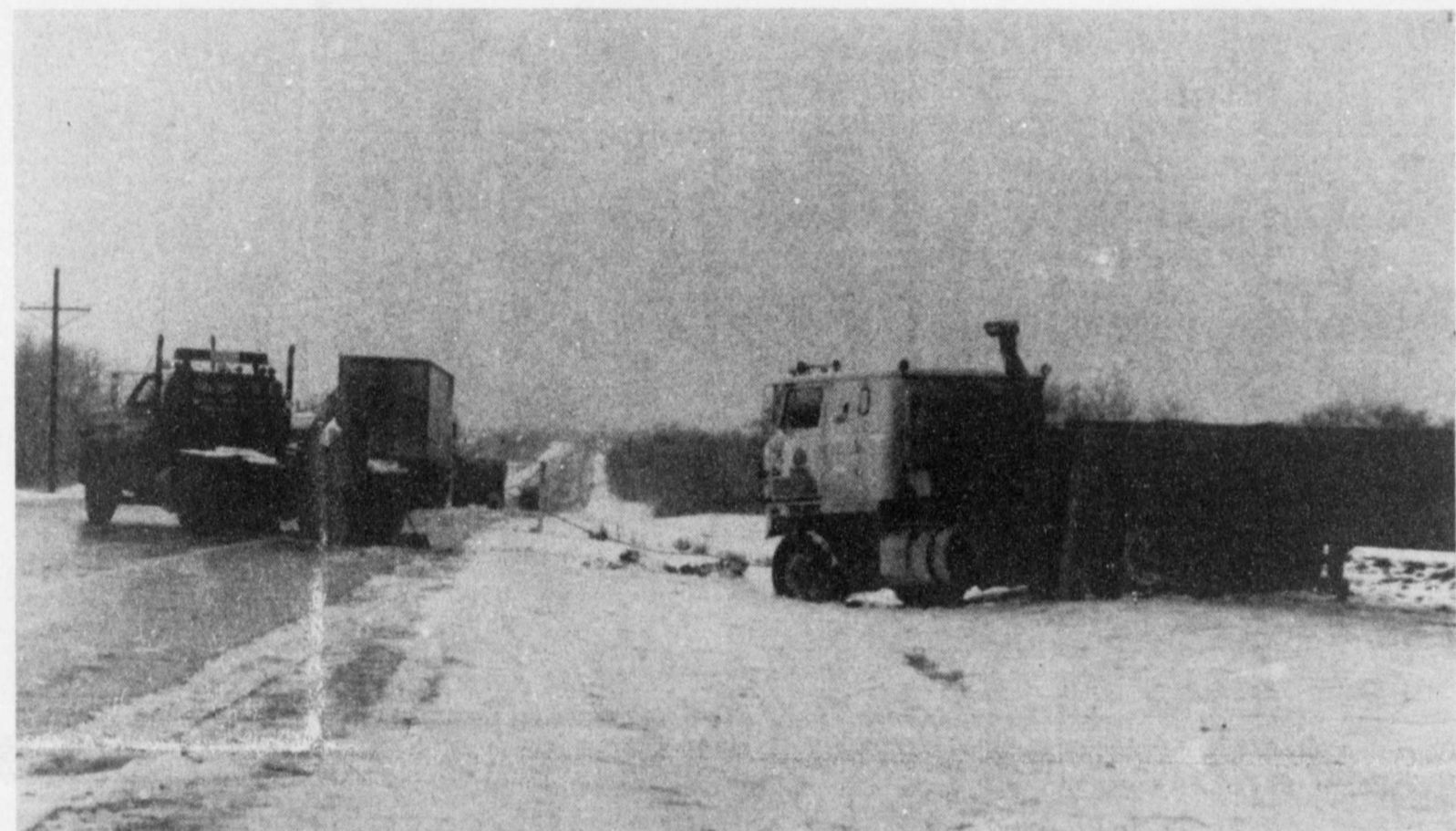
STRANDED —This eighteen wheeler loaded with pipe required the

For additional information, a free copy of IRS Publication 505, "Tax Withholding and Estimated Tax," can be ordered by calling the IRS number listed in the local telephone directory under U.S. Government.