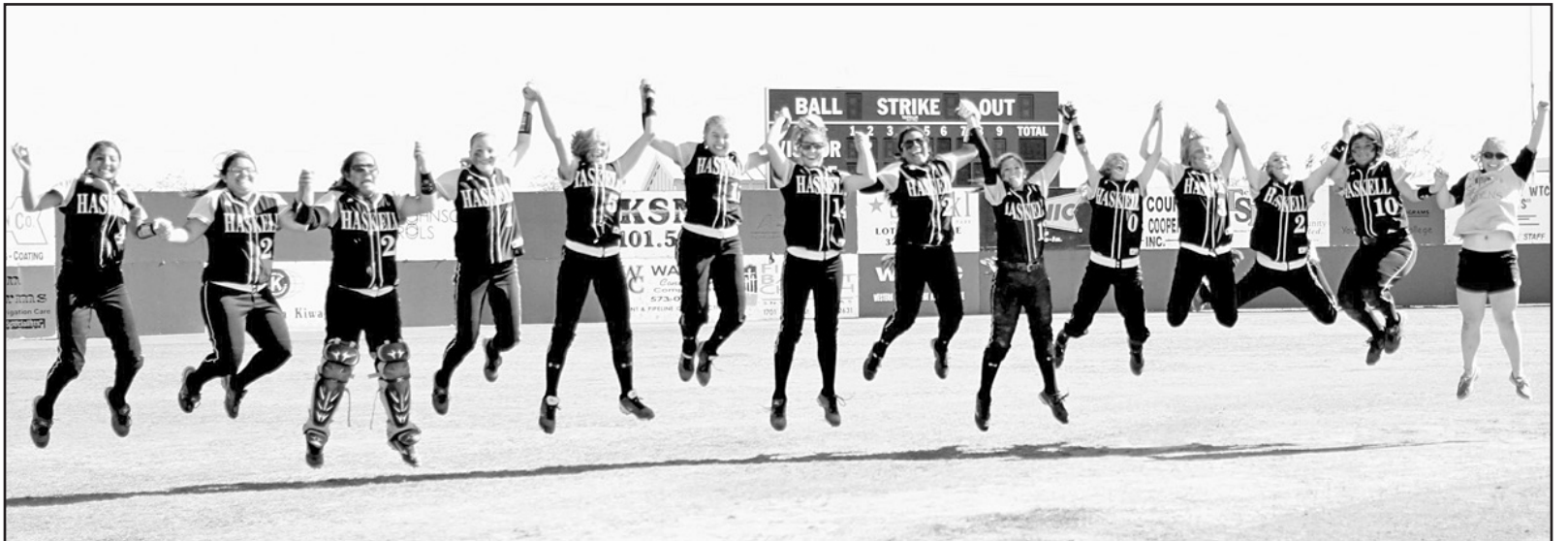
HASKELL MAIDENS - 2014 REGIONAL QUARTERFINAL CHAMPIONS