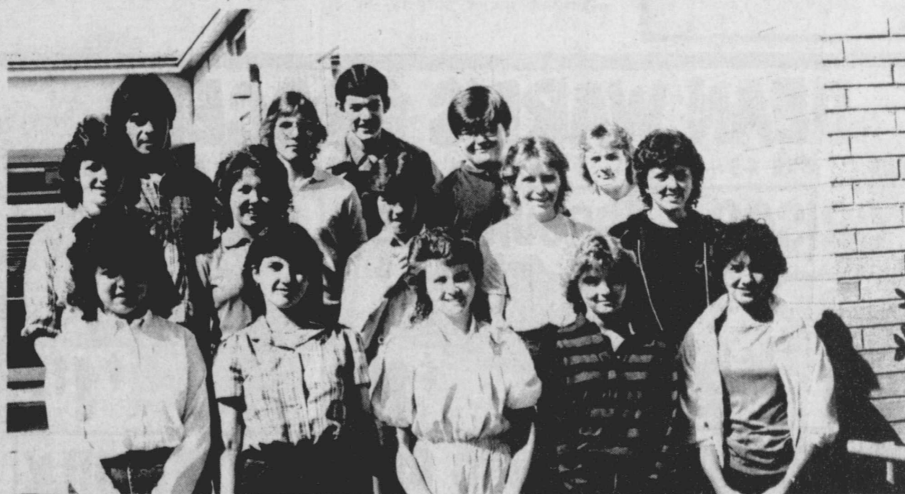
ALL DISTRICT BAND—Rivercrest band students traveled to Harmony March 28 for try-outs to participate in the