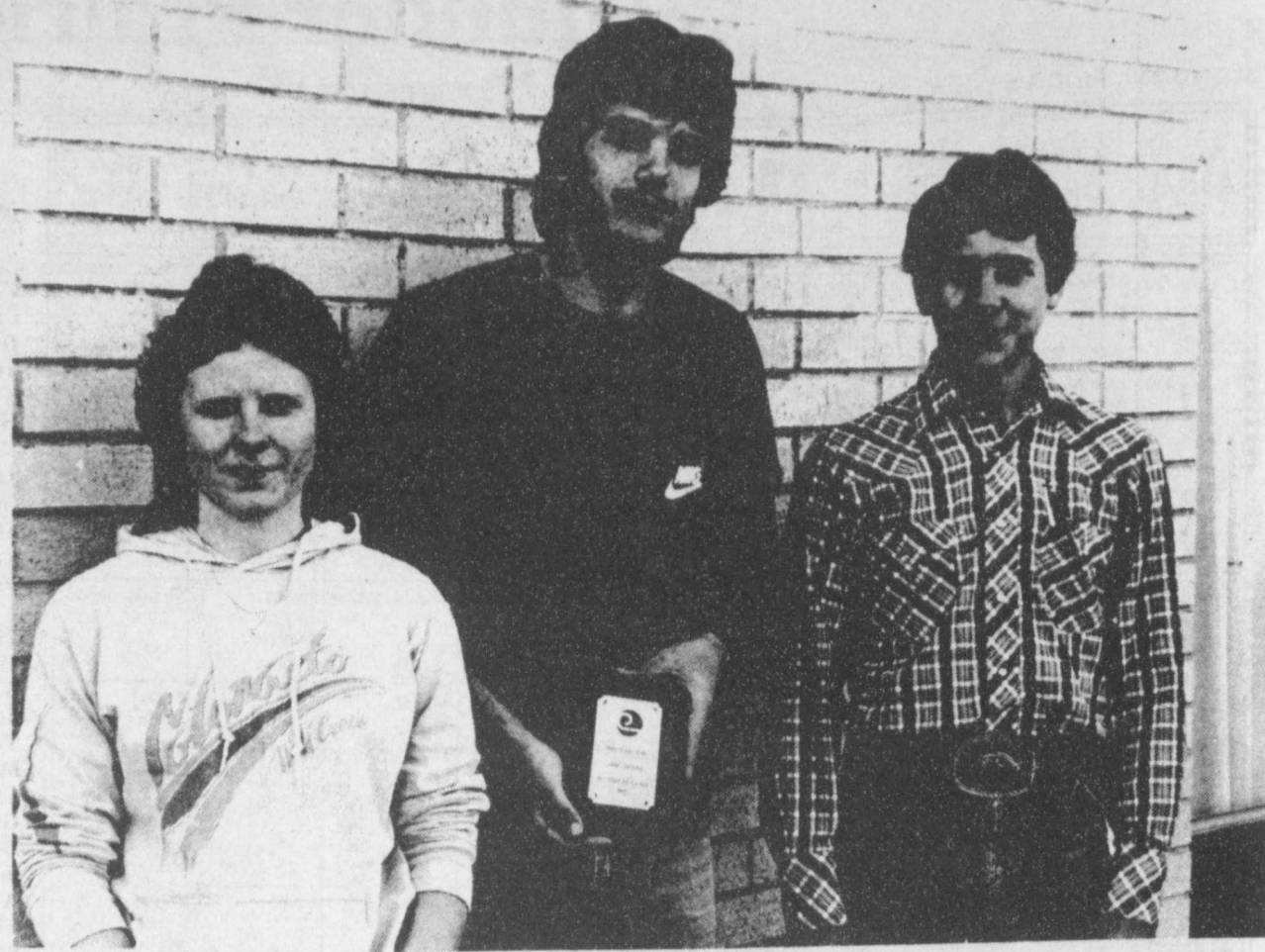
LAND JUDGING—The Soil Conservation Service Field Day Contest was held in Clarksville March 26. The Rivercrest Land