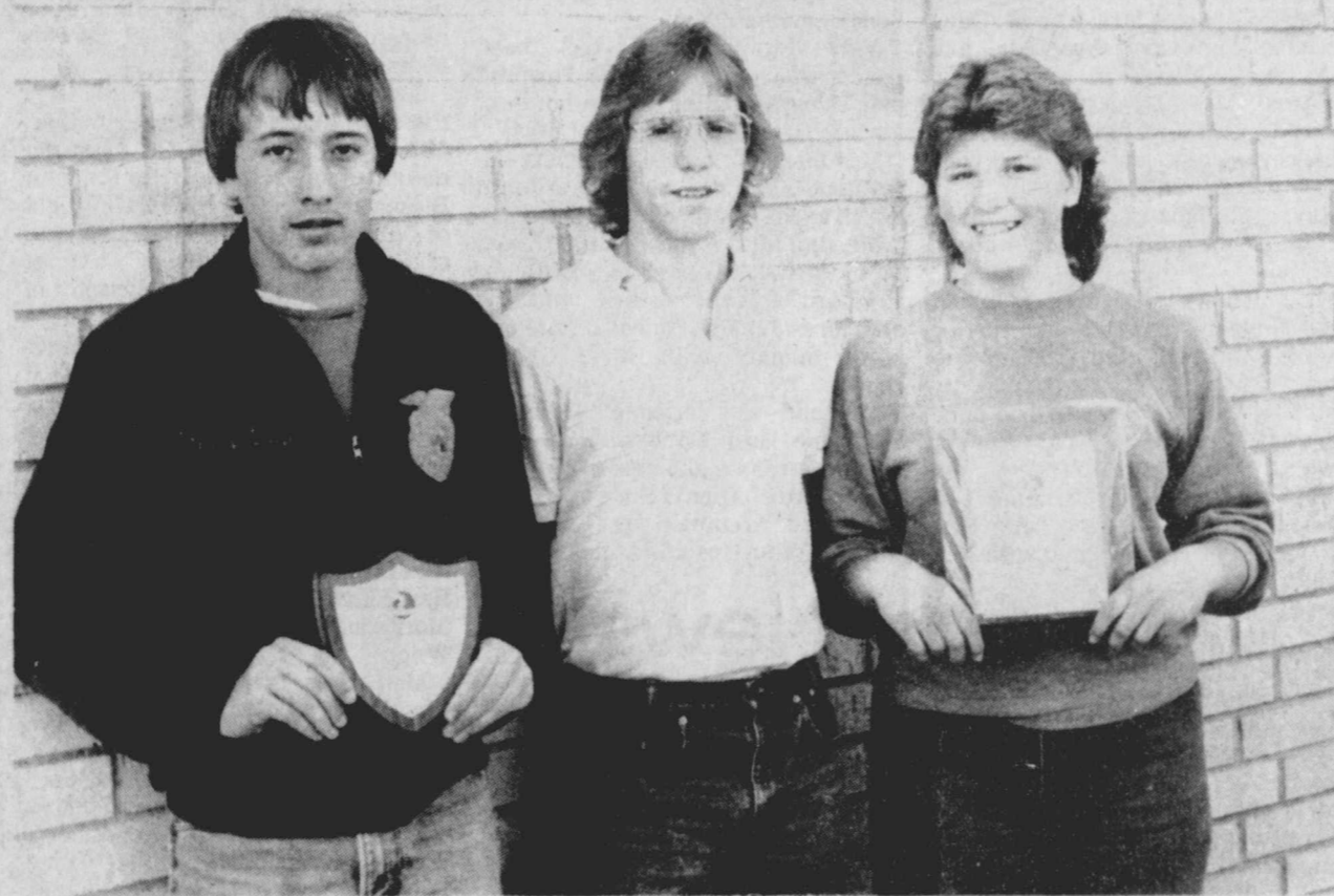
WOODLAND TEAM—The Rivercrest Woodland team placed first in the Soil Conservation