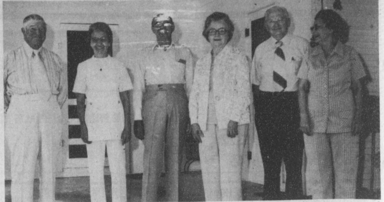
MEMBERS of the graduating class of 1925 Bogata High School taken at the 50th reunion ten