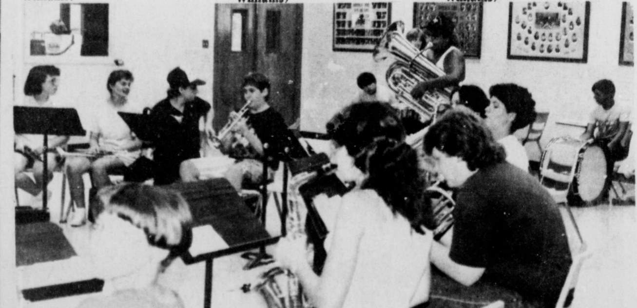
TALCO-BOGATA Band Boosters organization sponsored a clinic for the 1987 marching band. The instructors for the two day clinic