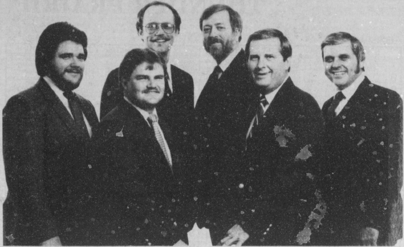
NATIONALLY KNOWN Trinity River Boys will be in concert Sunday night, August 30 at the First Assembly of God Church in Bogata