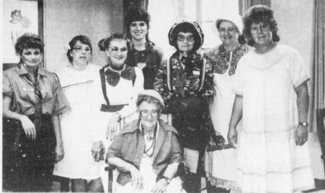
RESIDENTS and employees of Red River Haven Nursing Home in Bogata dressed up in tacky apparel for Tacky Day, which was held during National Nursing Home Employees Week.

APPLIANCE SALES & SERVICE Parts & Service Available On Most Major Brand Appliances Call Today 427-5441 or 427-5990 Clarksville