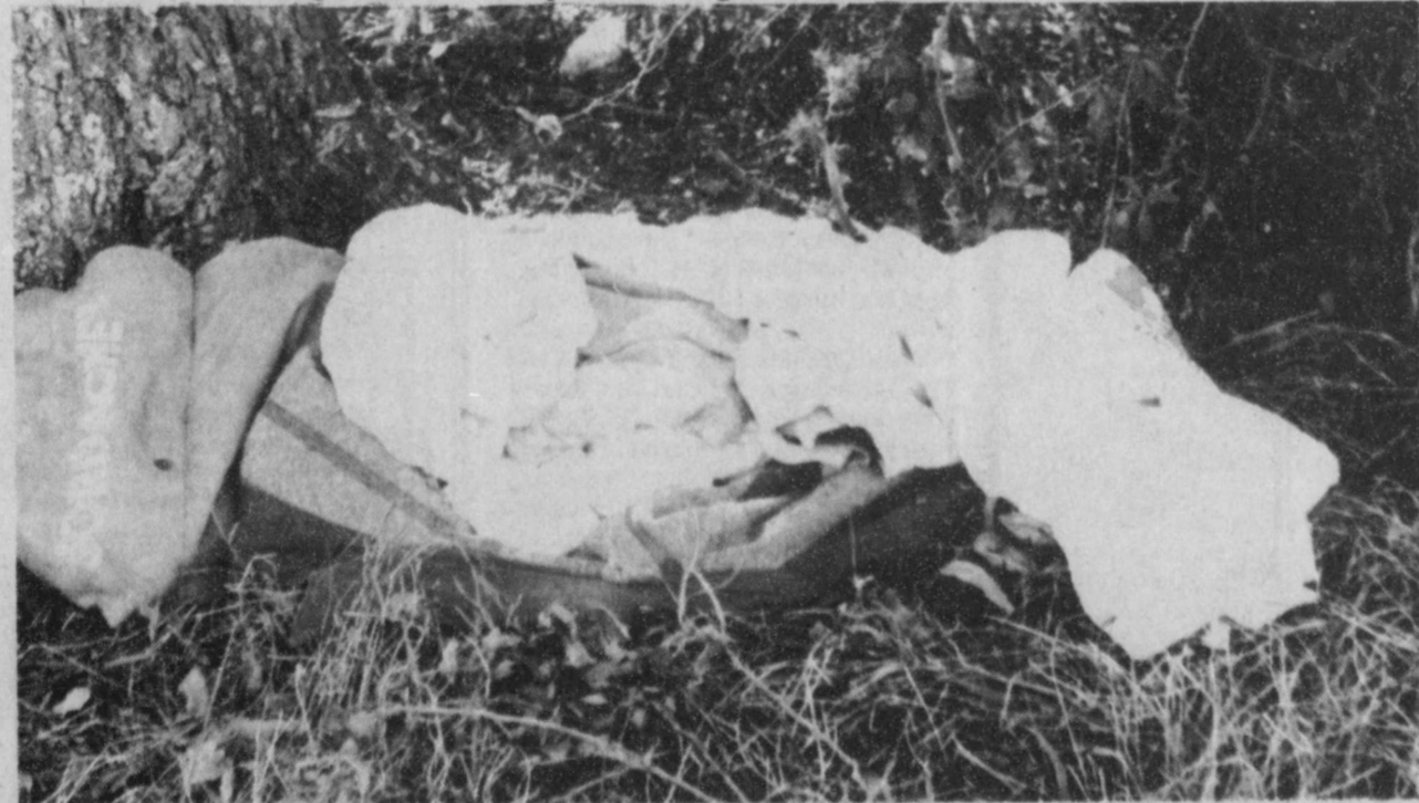
CLOTHING CACHE-Clothes and other items were stolen in several burglaries in Johtown on Monday night. The crimes may have been