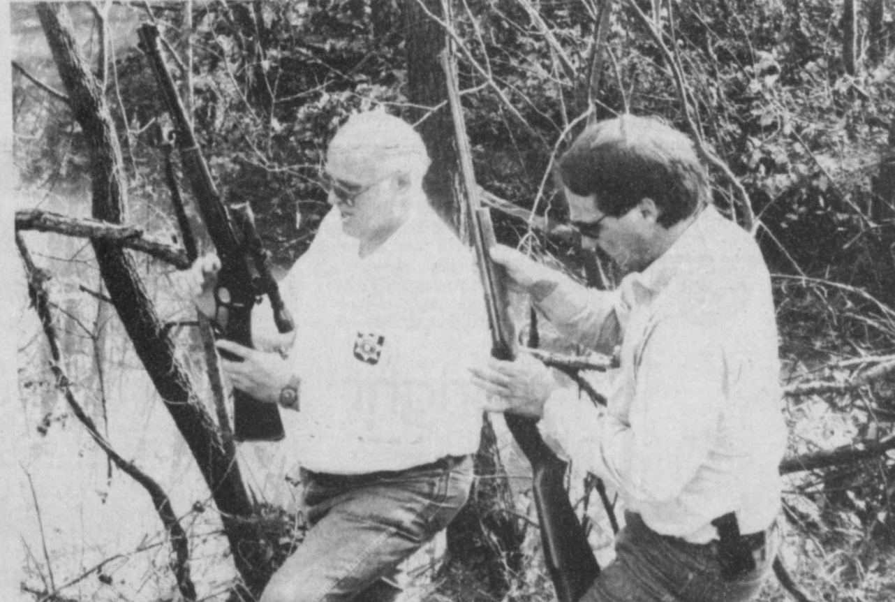
RED RIVER County Deputies recovered two rifles, part of a number of items apparently stolen in a series of burglaries at

The juveniles will remain in custody of Red River County Sheriff's Department pending further investigation of the case. No further details were available at press time.