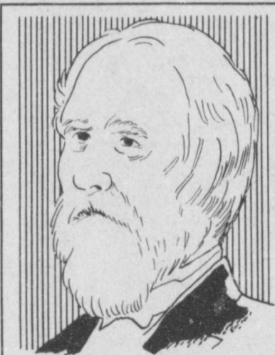
Being all fashioned of the self-same dust. Let us be merciful as well as just. Henry Wadsworth Longfellow