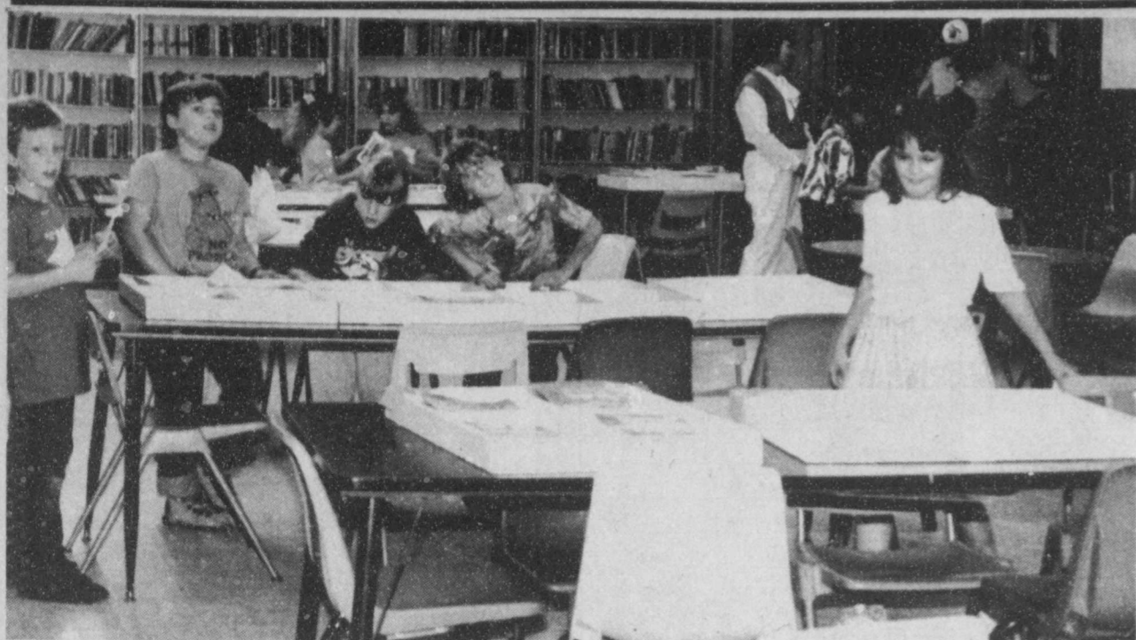
BOGATA Elementary students enjoyed looking at the books on display at the Book Fair sponsored by the school. Profits from the fair will be used to buy a display rack for paperback books and more books.