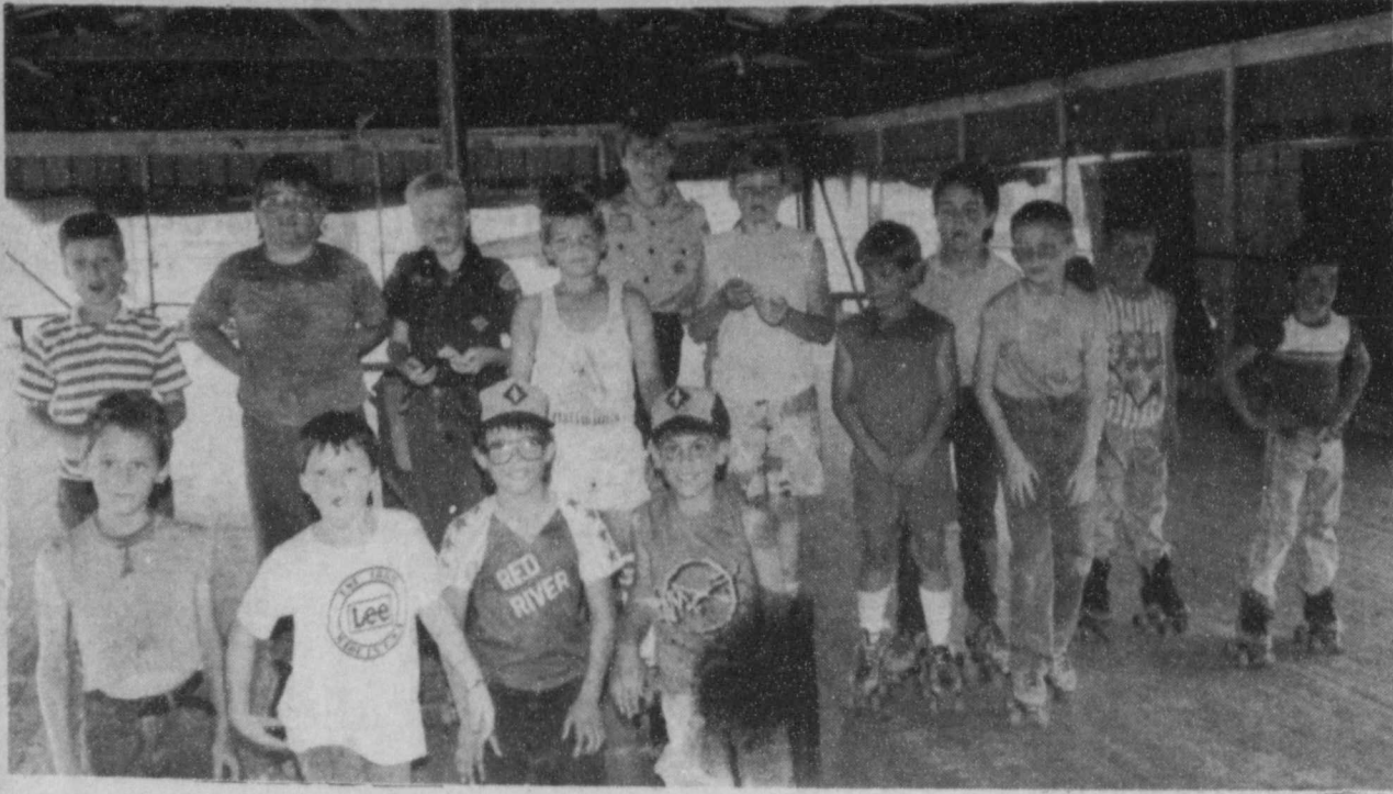
THE FINAL MEETING for the year of the Bogata Boy Scouts was held May 30 at Denny's Skating Rink. Approximately 40 boys attended.