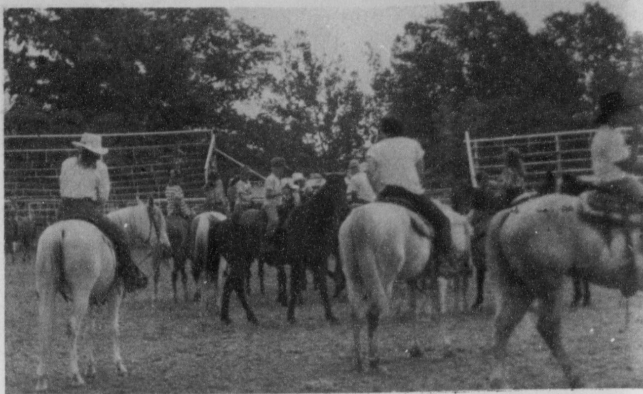
ARIGO RIDERS 4-H Club sponsored a three-day horsemanship clinic at the Bogata