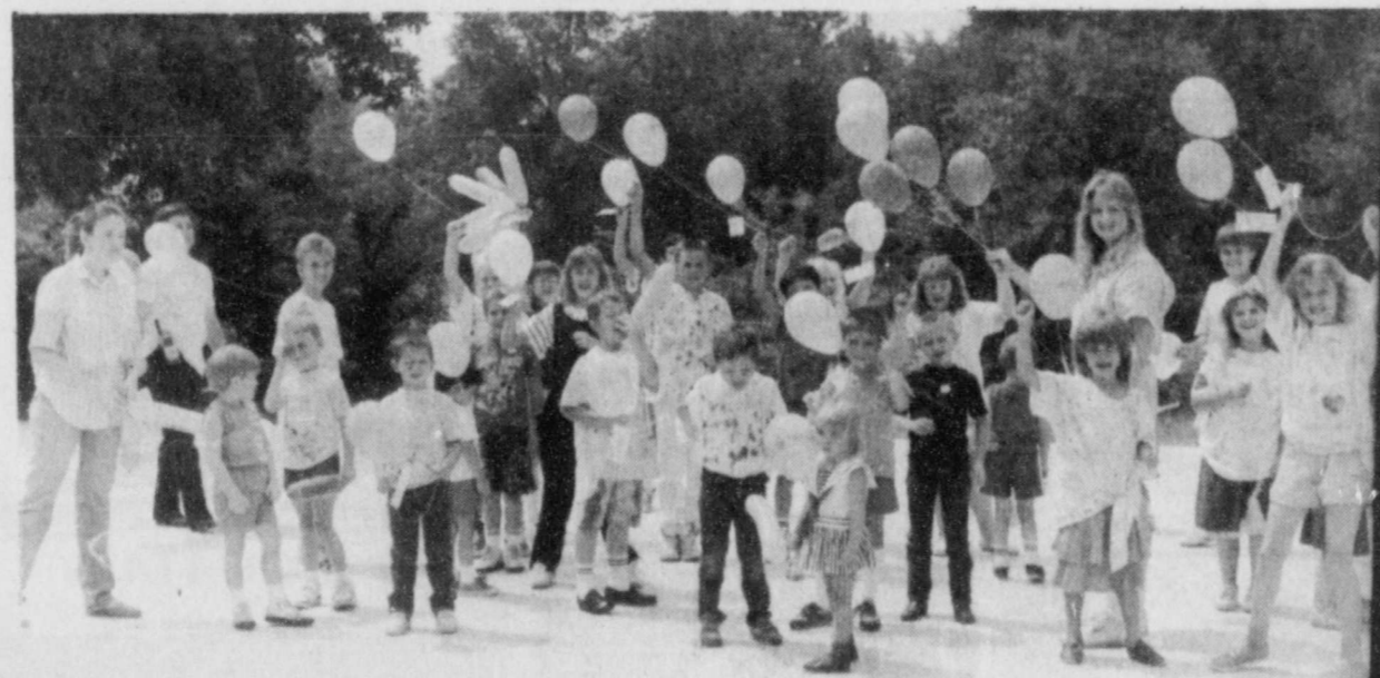
CHILDREN that attended the Calvary Baptist Church Vacation Bible School in Talco re-

Don't miss the action on June 22-23-24 at 8:30 p.m. nightly with the opening of the 1989 Bogata Rodeo!