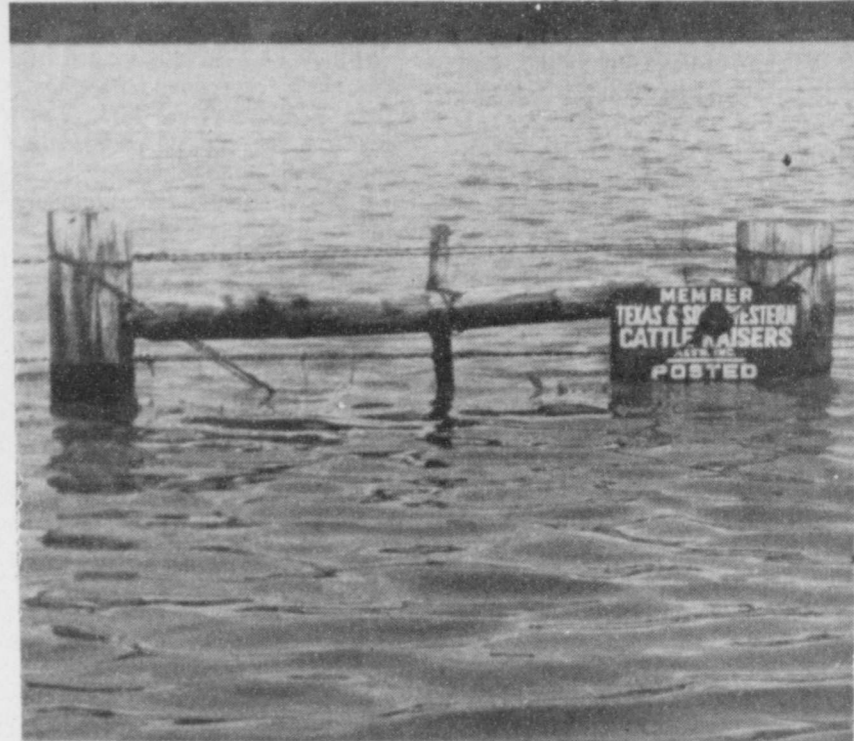
HIGH WATER turned pastures into lakes last Wednesday, leaving the fences by Brushy Creek

Meanwhile, the weather continues to remain a topic of conversation and a subject of concern.