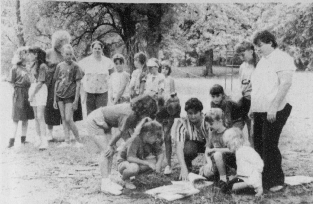
DAY CAMP was held for Girl Scouts at the Bogata Community Center, Brownie Troop 19 as they were working on Merit