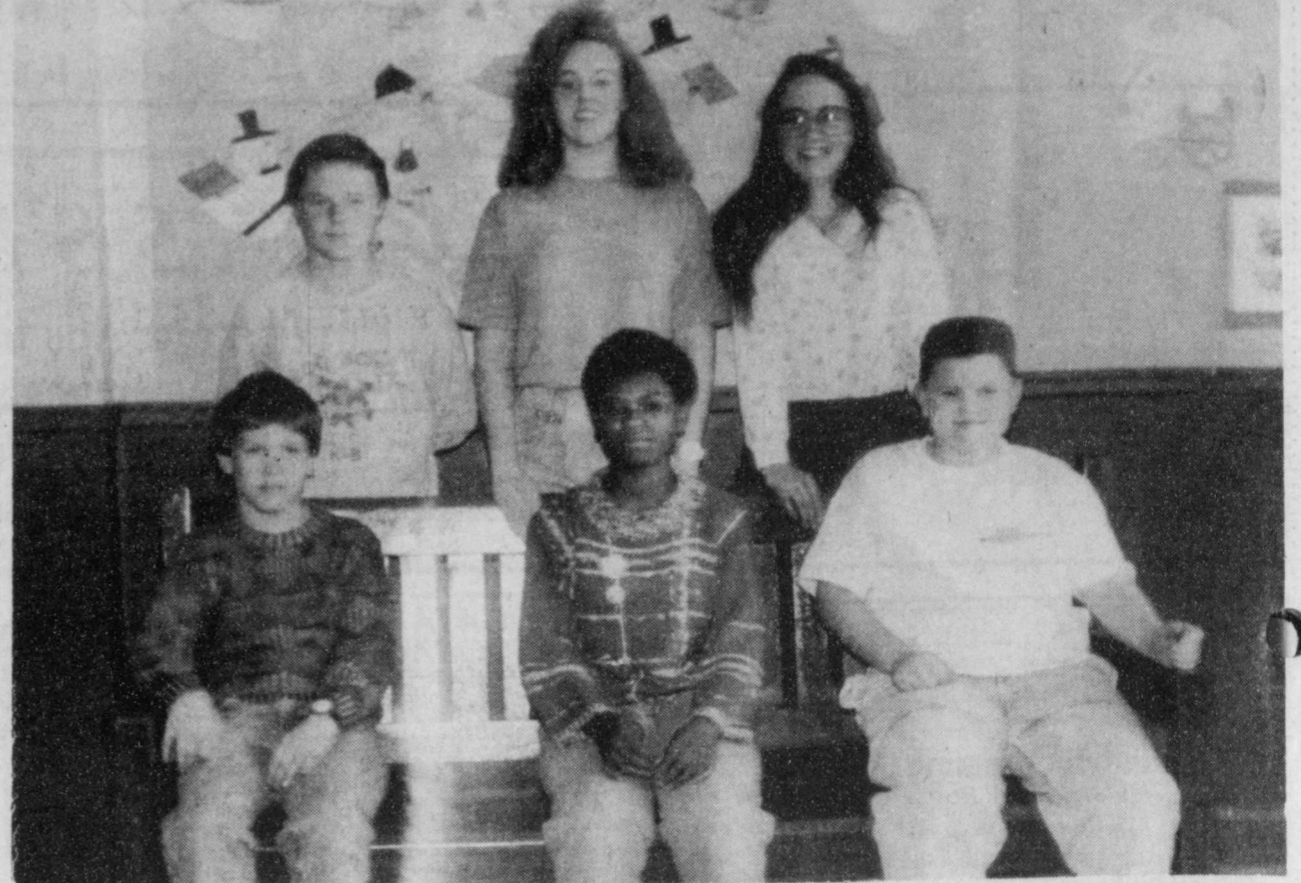
SEVENTALCO Band students received Superior medals at the Harmony High School Solo and

The teams will play again on Friday, at 5 p.m. at the Talco and Bogata Gyms. Everyone is invited to come out and enjoy the local youth pplay ball.