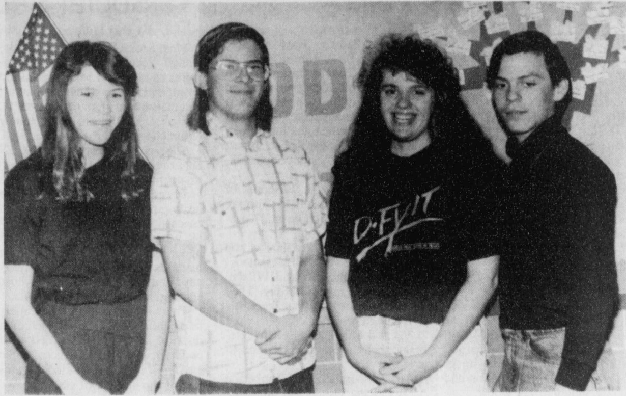
ALL OF THE Rivercrest High School Students receiving superior ratings at the Band Solo

The Housing Authority of the City of Deport is interested in you and your housing needs. Contact the Housing Authority Office at 652-2744, for further information. 3-7