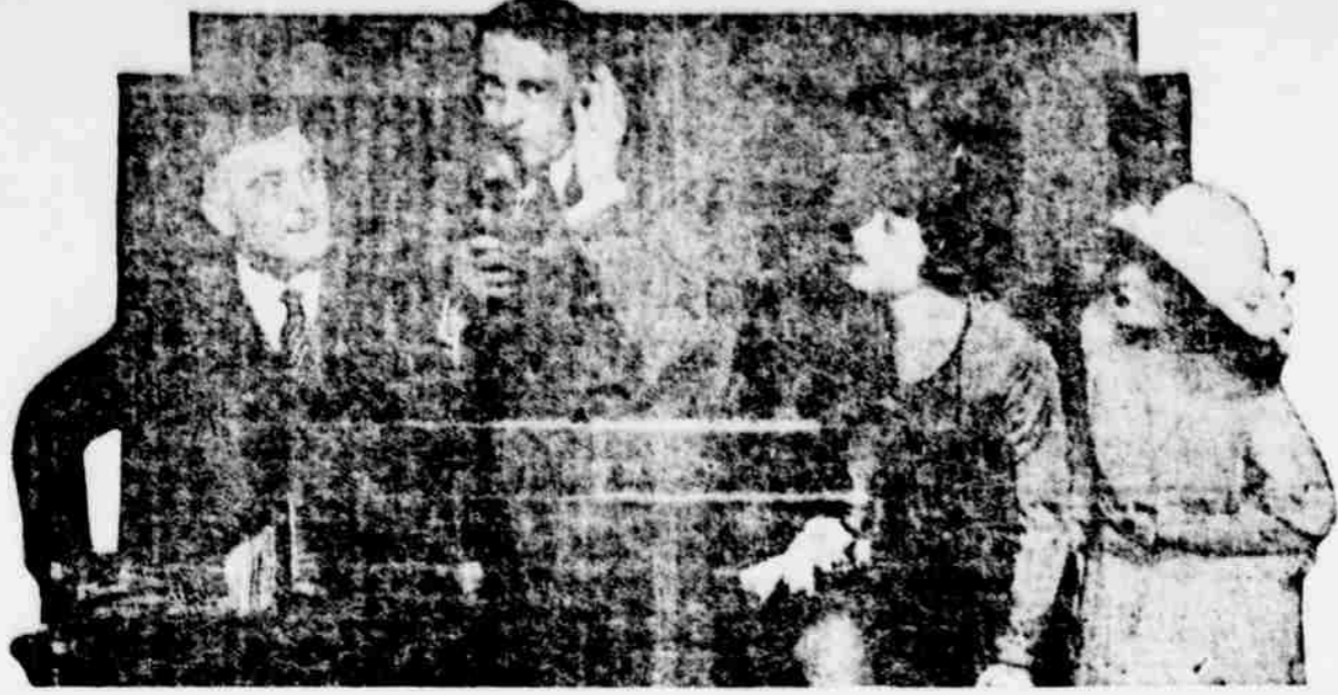
The New York Players, one of the biggest attractions on our Lyceum course, will present "Cappy Ricks," a comedy-drama taken from Peter B. Kyne's famous stories in the Saturday Evening Post.

Nearly everyone has read this story of the sailor man, an officer in Cappy Ricks' fleet, who dared to follow his own conviction and as a result found himself fighting his former boss and the father of the girl he loves.