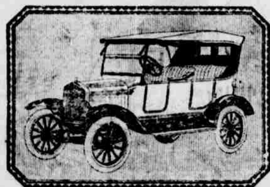
New Touring Car