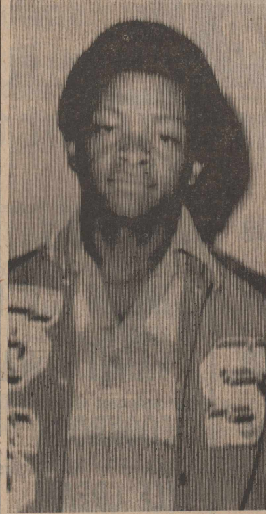
All-South Plains Team