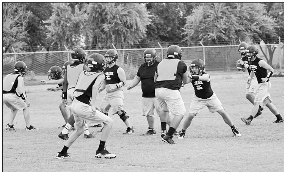
NEW SEASON —The Haskell Indians are getting ready for some football! They begin the season with a scrimmage against Seymour Fri., Aug. 18 on Indian Field at 6 p.m.