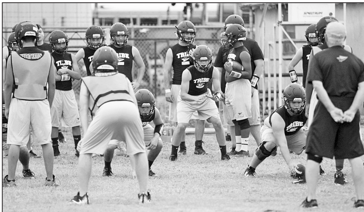
FOOTBALL SEASON STARTS —The Haskell Indians ready for an exciting season that begins Fri., Sept. began two-a-days this week. They are getting 1 against Roscoe on Indian Field at 7:30 p.m.