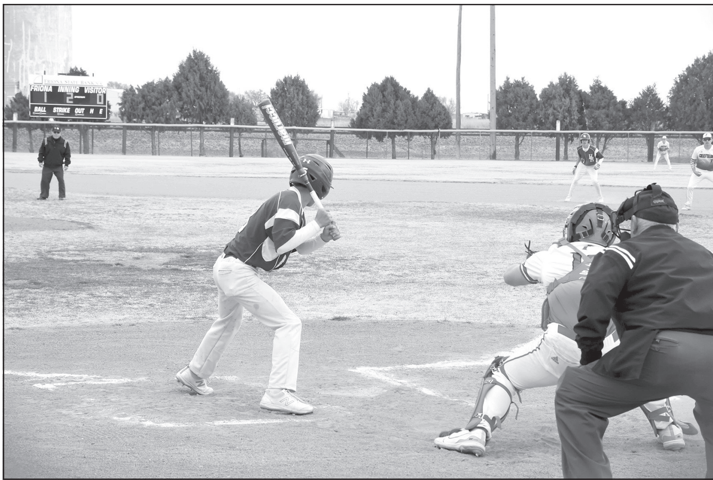
The Friona Chieftains will host the Tulia Hornets beginning at 4:00 p.m. this Friday at Chieftain Ballpark.