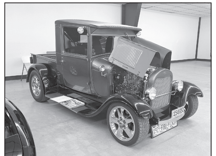
Best of Show & Oldest Vehicle 1929 Pickup J.W. Barrt