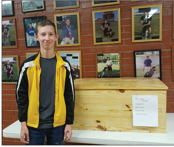
Allen Lumpkin — Storage Chest.