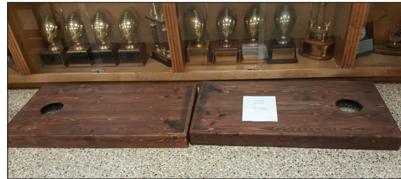
Joel Contreras— 2 Corn Hole Boards.

The remainder of the wood shop projects will be printed at a later date.