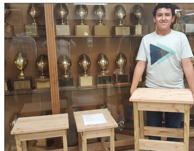
Josue Sigala Gonzalez—3 Side Tables.