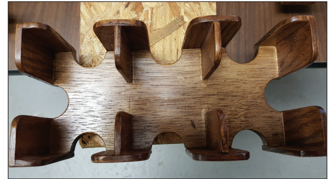
Hand & Foot Card Holder

The remainder of the wood shop projects will be printed at a later date.