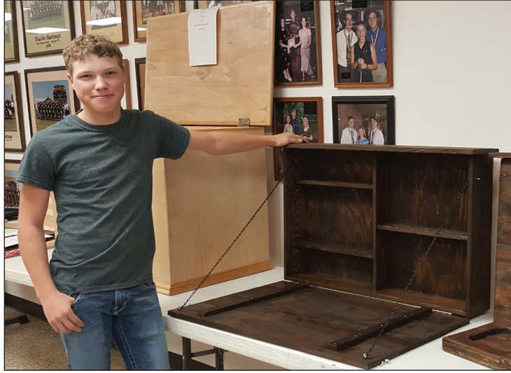
Cooper Adams—2 Drop-Down Wall Cabinets.