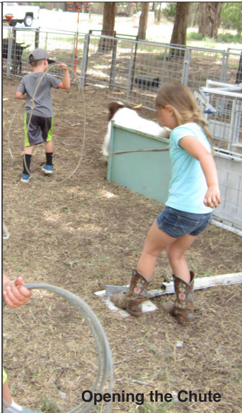
Opening the Chute