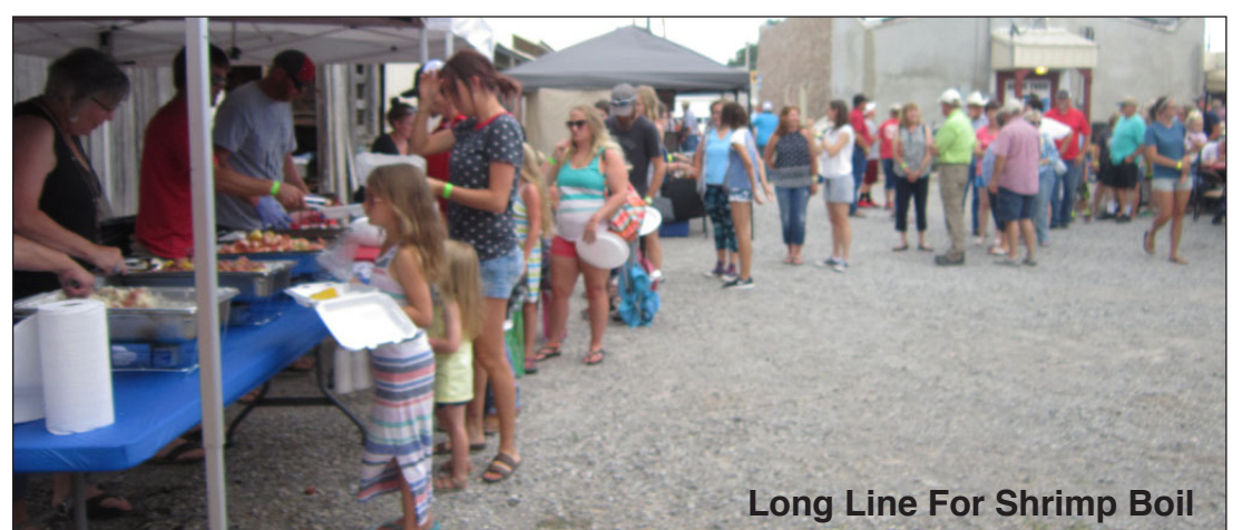
Long Line For Shrimp Boil