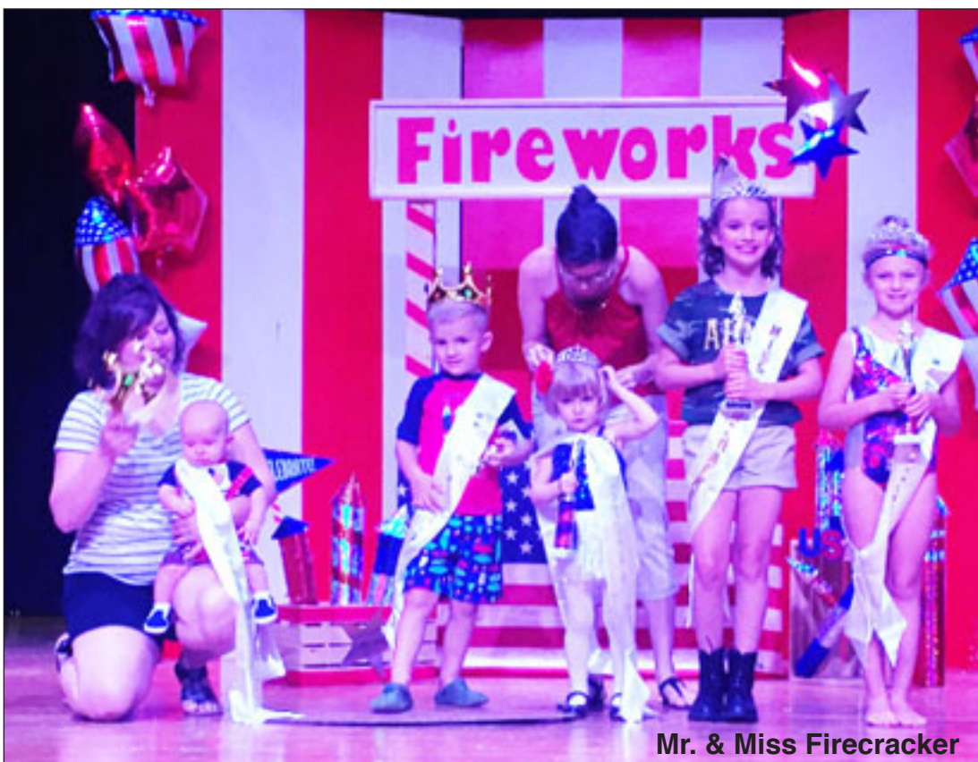
Mr. & Miss Firecracker