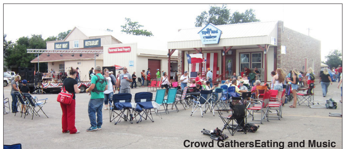
Crowd Gathers Eating and Music