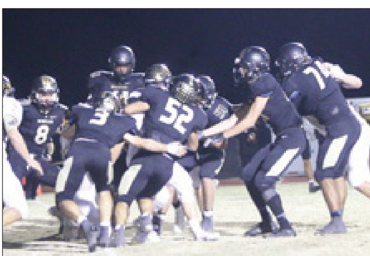
Mustang Defense pushing the Wildcats out of the end zone.