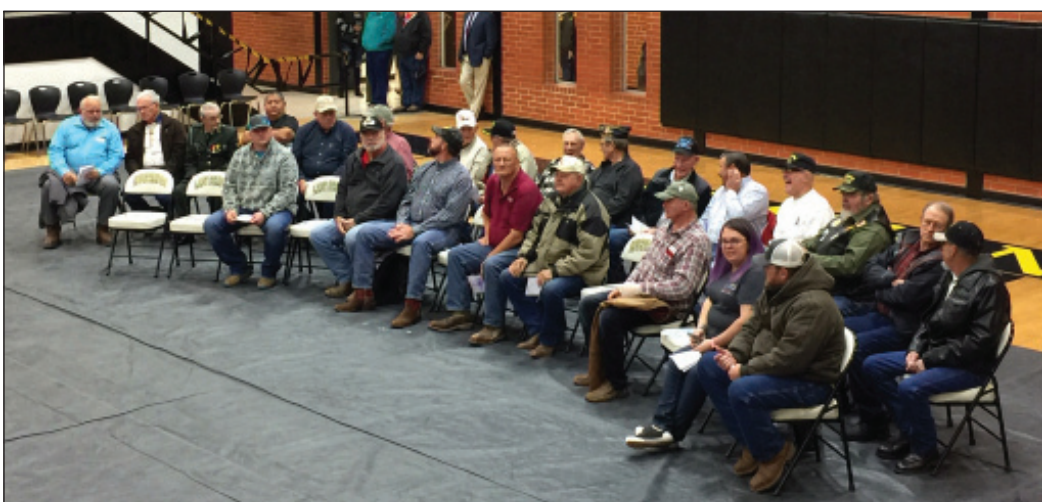
Wheeler Veterans in attendance at Wheeler I.S.D. Veterans Day Program.