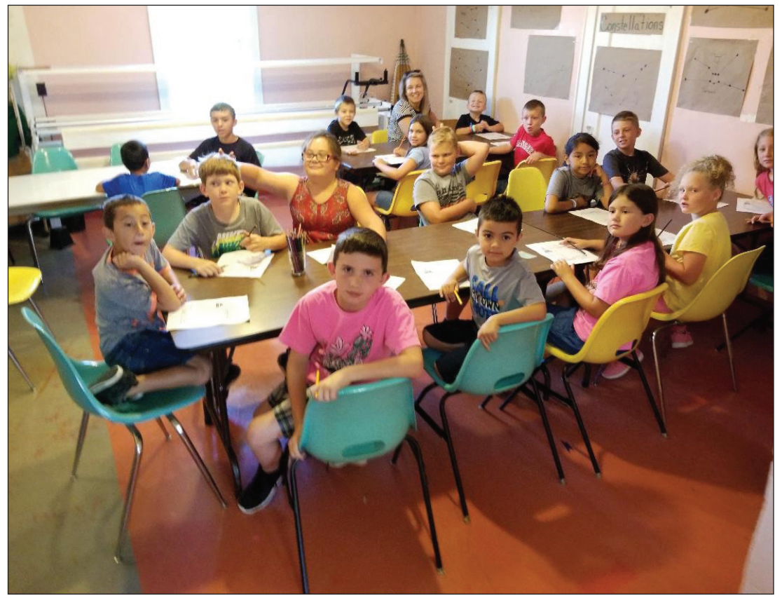
Youngsters six and seven attending Wheeler Library Summer Reading Program

Sign our online guest book at RobertsonFuneral.com .