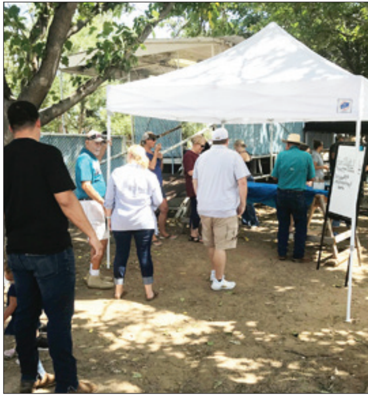
In line for ice cream