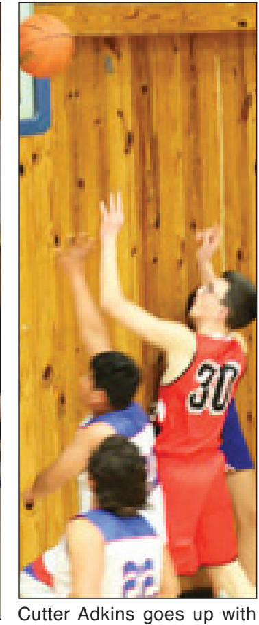
a jump shot scoring for the Cougar team.