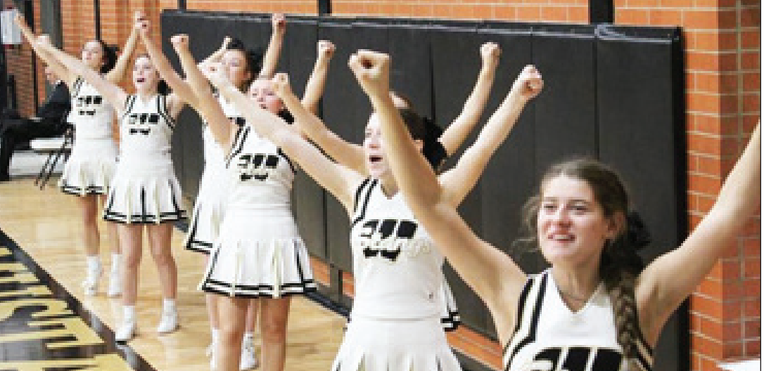
Wheeler High School Cheerleaders