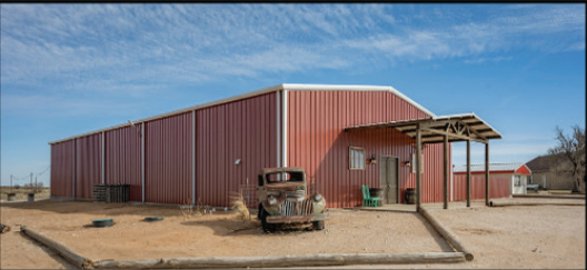
7690 Hwy 83 Wheeler, TX 79096 6 +/- acres | 1,700 sq ft home | 80x50 Event Center $390,000