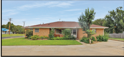
701 S. Red River St. Wheeler, TX 3 Bed | 3 Bath | 2,029 sq ft | Oversized Corner Lot $195,000