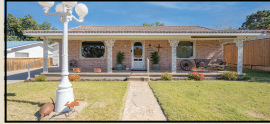
1007 S. Canadian St. Wheeler, TX 3 Bed | 2 Bath | 2,846 sq ft | 2 Living Areas $227,000