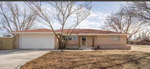
109 W 10th St. Wheeler, TX 79096 3 Bed | 2 Bath | 1,984 sq ft | New Fence & Driveway $168,000