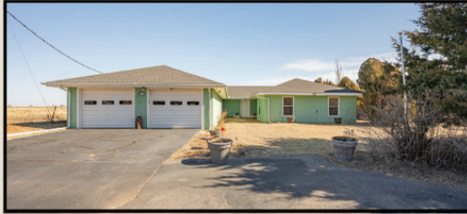
159 Greenway Dr. Allison, TX 5 acres | 3 Bed | 2.5 Bath | 2,346 sq ft $225,000