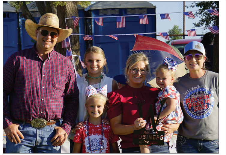
Business of the Year — Koepke Sales & Koepke Legacy Insurance