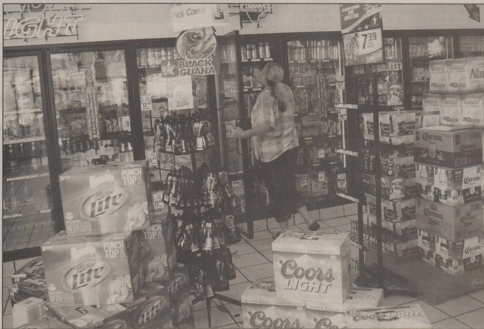
The sale of alcoholic beverages became a reality in Knox City last Friday when Penman's Services received a shipment. The sale of alcoholic beverages for off-premise consumption was approved by local voters last month.