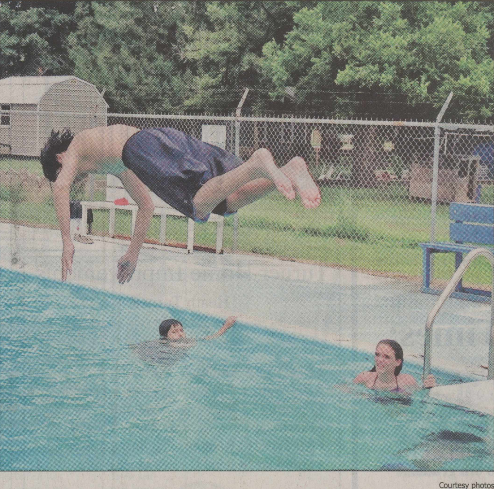
Youngsters are shown enjoying the City of Knox City Swimming Pool Tuesday afternoon after it opened last Saturday. (See story, page 4)