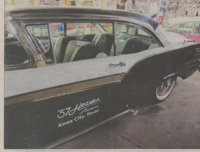
A pair of old cars are among the items on display at the "57 Heaven Museum" in Knox City.

Since this would have undermined the policies in effect as well as the spirit, Abbott wisely vetoed the measures.