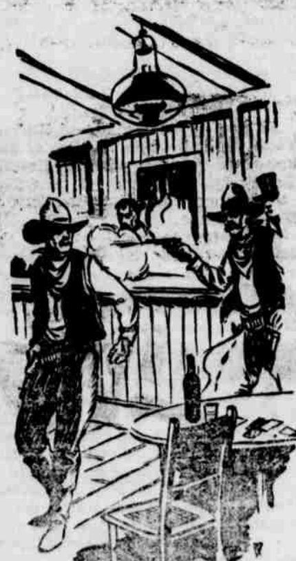
"The Bullet Caught Him In the Neck and Partly Paralyzed Him."

"So Fourth of July night, when I came down the stairs, I walked from the bar out through the archway into