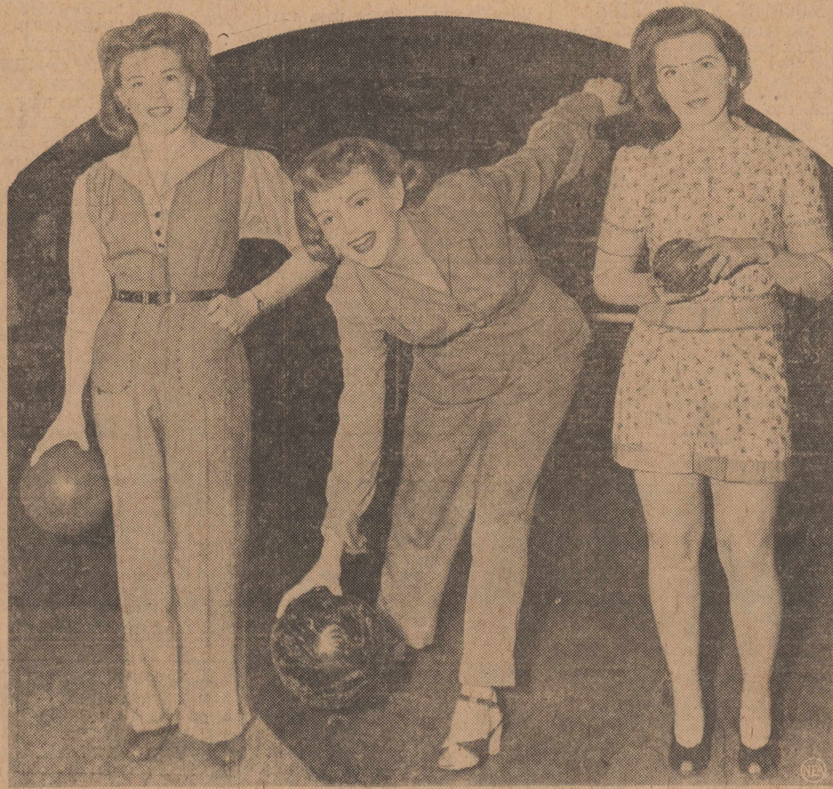
THE big increase these days in the number of women bowlers has precipitated a wide variety of smart new outfits to help make the sport even more enjoyable for the gals.