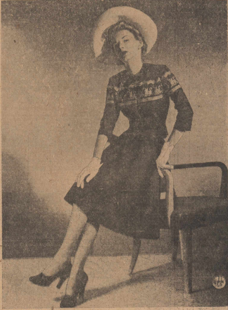
South of the border influence is seen in this trim summer suit of navy blue cotton Jalapa cloth (modern version of muslin.)