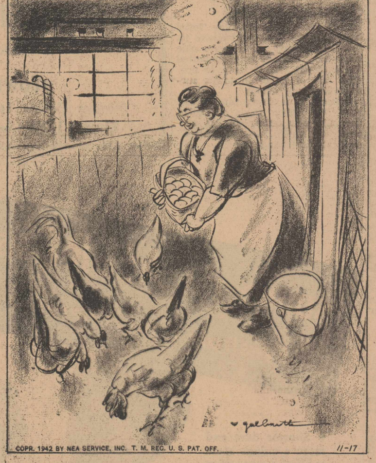
"You've certainly got the idea, girls! Since that war plant has started its night shift, your egg output has doubled!"