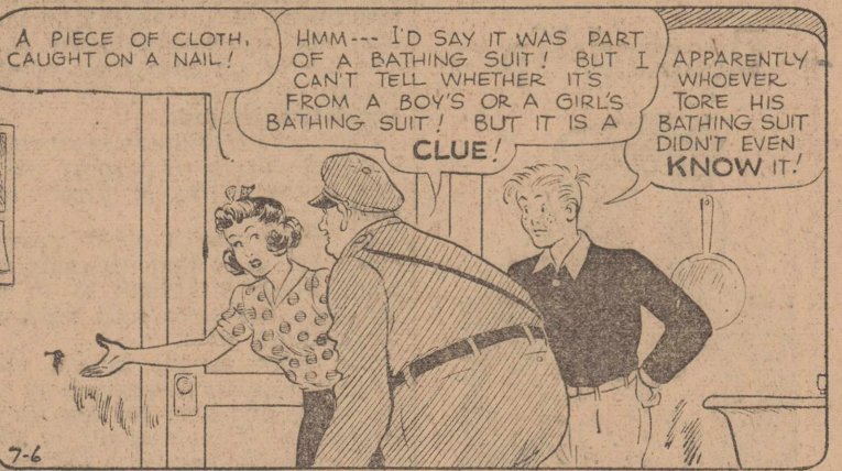
No other deaths were reported, FRECKLES AND HIS FRIENDS