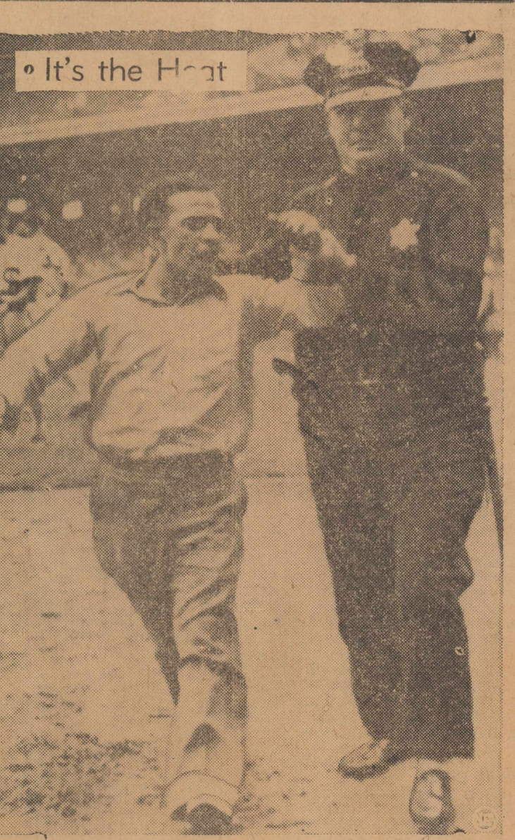
Yankees taking four straight from White Sox at Comiskey Park proved too much for this fan, who is gently led away from the field after bouncing onto field to protest decision.