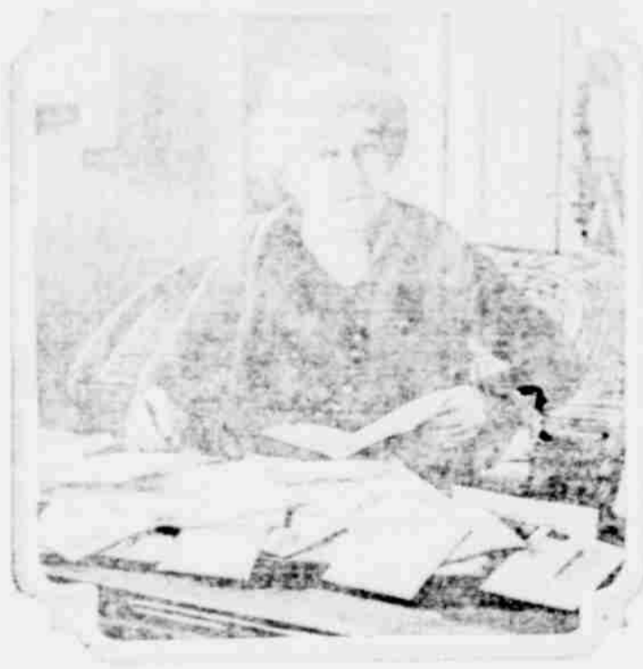
Dorothy Dix is busy answering a score of the hundreds of letters she mails her.

NEW YORK, Jan. 15.—Dorothy Dix, the famous advice columnist, is busy answering a score of the hundreds of letters she mails her. She is sitting at her desk in her New York City apartment, surrounded by stacks of papers and envelopes. She is wearing a dark dress and has a serious expression on her face. The room is dimly lit, with a lamp providing light on her desk.