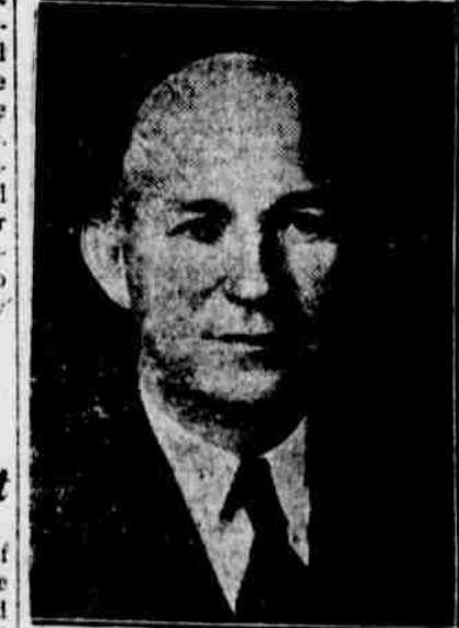
HON. CLINT C. SMALL

Senator Clint Small of Wellington, Collinworth County made a short talk Tuesday afternoon in the District courtroom in the interest of his candidacy for Governor.