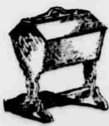
Table Lamps, Bridge Lamps, Foot Stools, Smoker Stands, Book Ends, End Tables, Magazine Racks, Cedar Chests, Occasional Chairs, Bird Cages, Console Mirrors, Buffet Mirrors, Mirror Cords, Gas Heaters, Percolators, Electric Irons, Bath Heaters, Table Silver, Turkey Roasters, Cake Boxes, Waste Baskets, Daisy Churns.