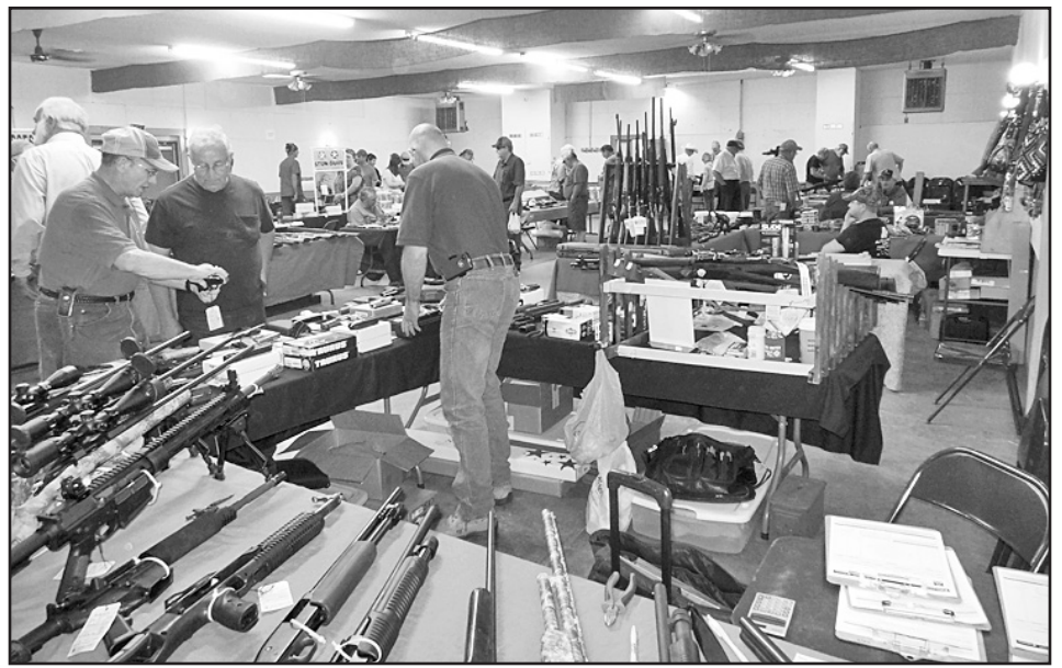
GUN SHOW —Twelve vendors and lots of visitors filled the gun show held last weekend at the American Legion Hall in Haskell.

Rule ISD and its staff will continue to work together, while focusing all their efforts to ensure the success of each of its students.