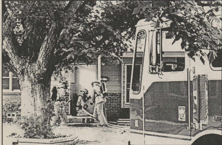
Photo above, three members of the Reese fire 'apartment prepare to enter quarters on :hell Blvd., in base housing, where a smoke rm went off. The results of that smoke alarm can be seen in the photo at right. The white box shows where the heater began to smolder and burn the waterbed mattress. In addition, some smoke damage occurred to the quarters.

Three members of the Reese fire department prepare to enter a building where there is a possible house fire. Fred Montis, center prepares to open the door to the house. Dennis Ryder, right, prepares to extinguish any fire with a fire hose, preventing additional damage and injury or loss of life. Airman 1st Class Jacob Chaulklin, left, prepares to knock the door down with a fire ax if entry cannot be acquired otherwise.