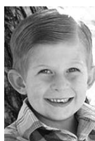
the cub reporter by benjamin estlack

bows and arrows, and learned about traps. I got to smell bobcat bait. Most kids thought it smelled like apples. I thought it smelled like poo in a jar.