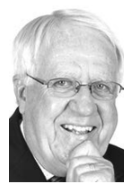
the idle american by don newbury

Clearly the store wasn't having a good day. Its soft serve ice cream machine was "on the fritz," and the single stall in the men's room had a simple handmade sign taped to the door: