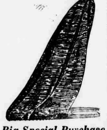
Big Special Purchase For Coats and Dresses

Smart short styles-Novelty weaves. These Panties would sell for lots more if bought in a regular way. 25c Specially Priced