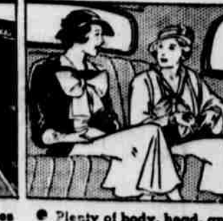
orking decidedly easy.