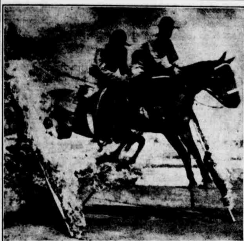
The spectacular fire drill of Troop F, Fifth Cavalry, U. S. Army, thrills spectators daily at the Texas Centennial Exposition in Dallas, as the horses leap through blazing barricades.