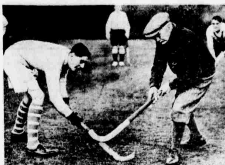
Although he is eighty years old, Rt. Rev. Arthur F. W. Ingram, bishop of London, England, just refuses to feel old. The bishop is shown here (right) as he took part in the annual hockey game for the old Maiburnians against Radley college in the grounds of Fulham palace recently.