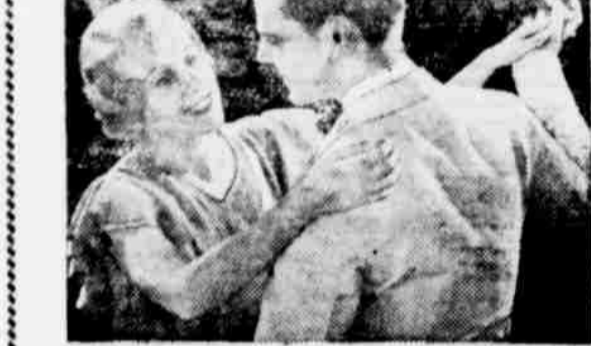
Summer Formal Wear, for men and women, must be odorless and fresh appearing! Modern Cleaner. Service brings you the kind of cleaning fastidious people demand for dressy occasions!