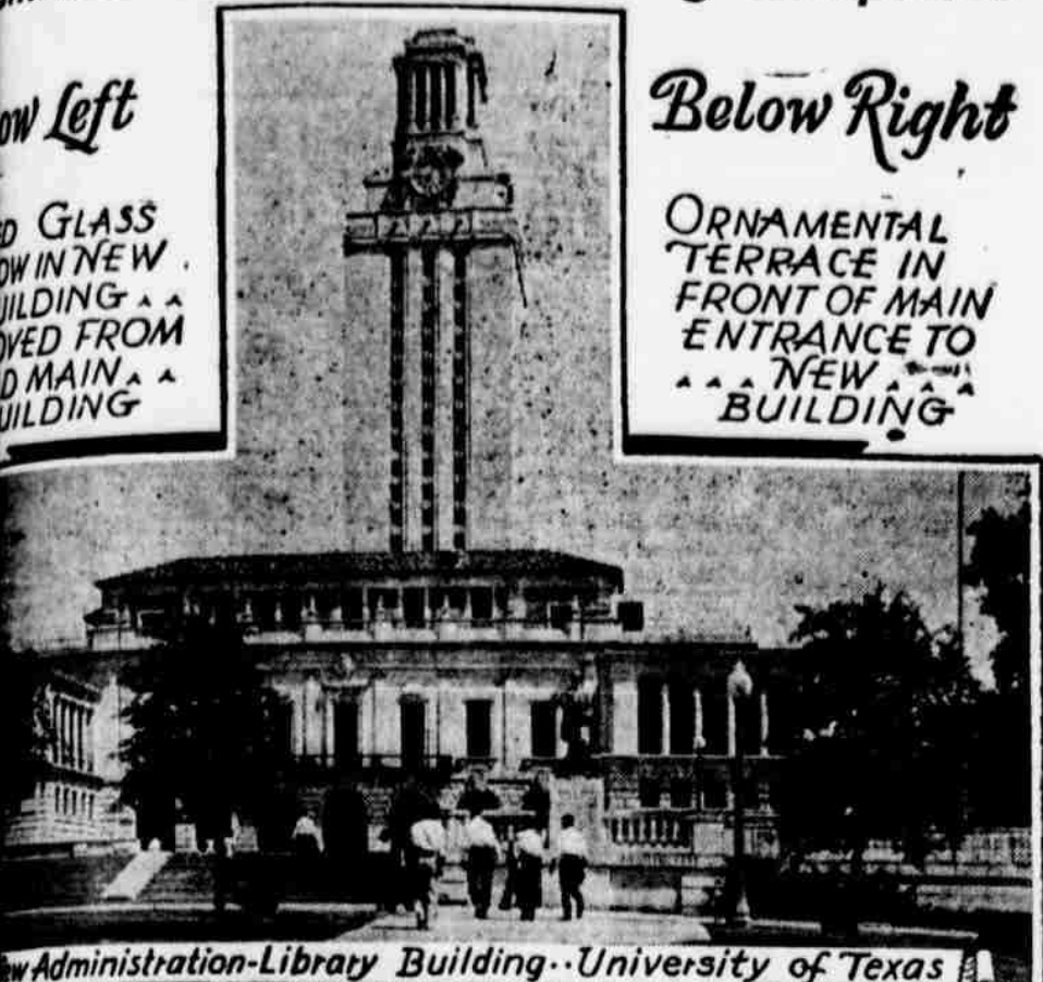
Administration-Library Building—University of Texas