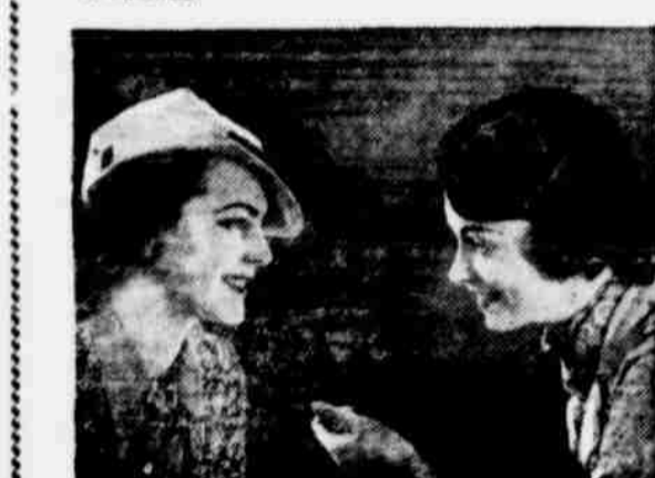
Shopping . . . street wear . . . summer luncheons and bridge parties. They're grand fun, when your clothes are clean and fresh. It's easy to keep your wardrobe that way, when it's cleaned often!