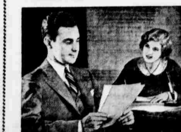
Hot Days in stuffy offices demand the kind of clothes that can "take it" . . . and well cleaned clothes will make business hours more pleasant for you and your associates. Modern Cleaner makes it easy!

Warmer weather means lighter clothes. And light colors and soft fabrics require more frequent cleaning to retain their smart appearance and comfort qualities!