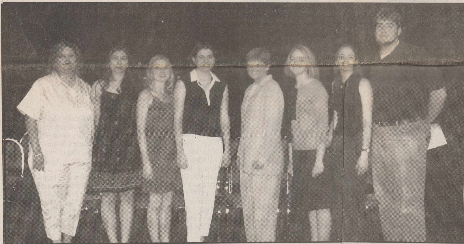
Who's Who Among Students in American Junior Colleges