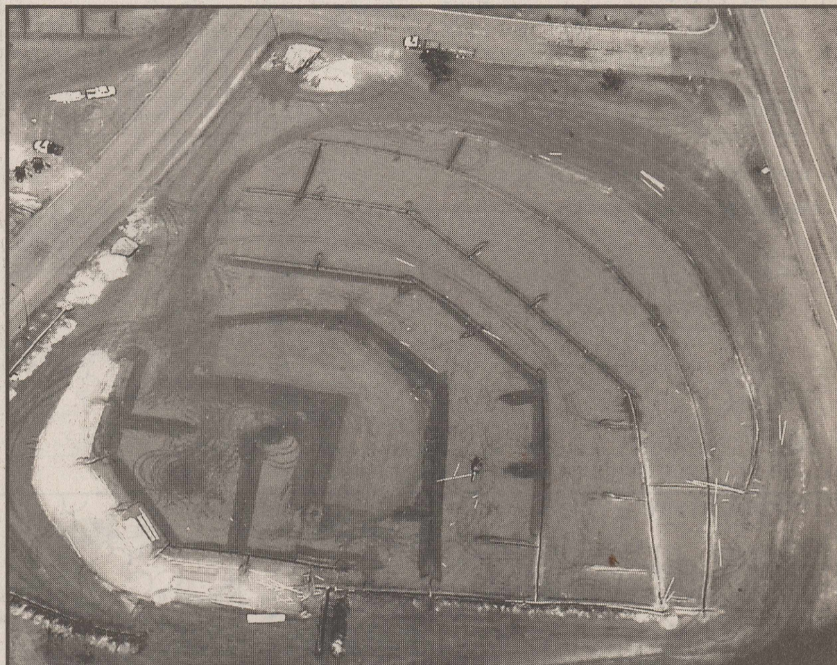
Aerial view of baseball field

Dirt work has been completed on the baseball and softball fields and the concession/restroom facilities have been completed. The main sewer line still needs to be completed. The irrigation system for the baseball field should be finished next week, and work will begin on the softball side. Grass should be sodded late next week on the baseball field. Concrete work began Thursday on the baseball