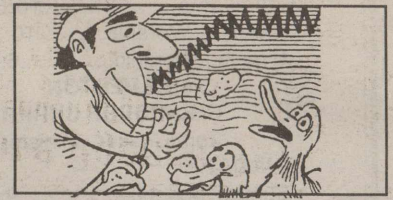
In Massachusetts it is illegal to feed ducks between 5 a.m. and midnight while humming.

ment and the entire community wish them well in their undertaking. Thanks to them for their public service.