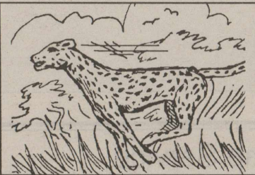
The cheetah, the fastest land animal, can not retract its claws.

Owls 17 33 50 62 Cotton Center 9 21 27 41