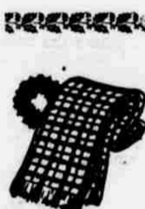
Men's Scarfs make a fine gift. We have a large selection for you in these hand woven Scarfs. 100% wool in solid and plaids. Prices