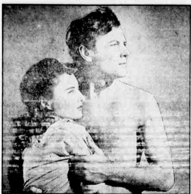
Barbara Stanwyck, as post mistress of the laborers at the end of the track and Joel McCrea, trouble shooter for the railroad in "Union Pacific" playing at the Texas Theatre Wednesday and Thursday, May 10-11.