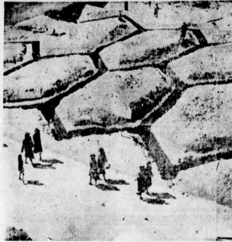
The slit trenches that cut up an area "some place in Italy" is a waffle-like pattern are being used by the Air WACs stationed near the headquarters of the 12th air force in Italy. This new type of trench is said to offer considerably more protection, and is harder to hit from air.