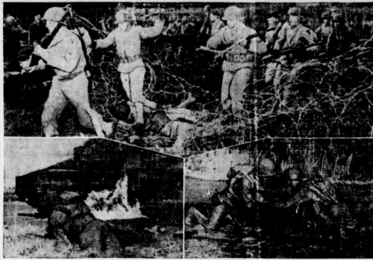
A group of Gen. Ben Lear's Second Army Rangers at Camp Forrest, Tenn., charge through a barbed wire entanglement at full speed (top), after the first two men had hurled themselves on top of the wire, carrying it to the ground to make the gap. Lower left: The Ranger who has just put the kibosh on an "enemy tank" with a Molotov cocktail (U. S. improved version) watches the result of his work. Lower right: Two Rangers are engaged in a little practice bout in the mud. They are taught all kinds of fighting, with all kinds of weapons. Sometimes the instructors have to interfere in brawls like this, as the boys get too interested.