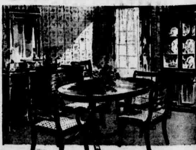
All Dining Room Suites Reduced

STORE CLOSED JANUARY 31st FOR INVENTORY.