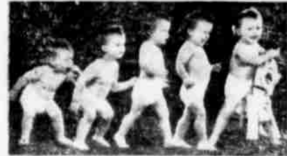
Bright Gingham-like Checks on Waterproof plastic...

Playtex DRESS-EEZ BABY PANTS Comfortable 89c